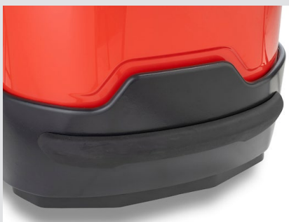
Front casted steel bumper