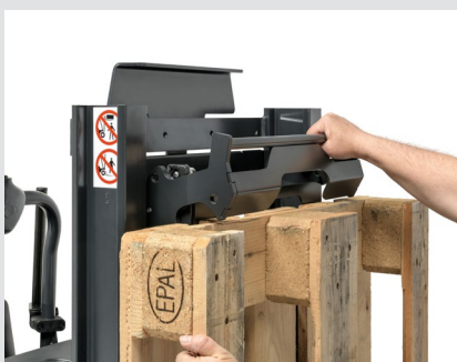
Easy-to-use pallet locking