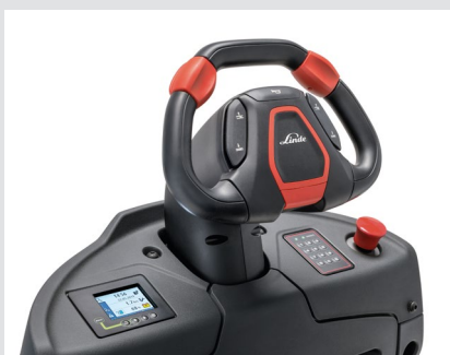
Intuitive Linde steering wheel