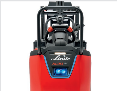
Linde BlueSpot™ and front LED light